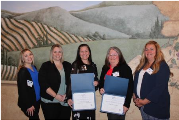
Express Employment - Employer of the Year

Special thanks to all committee members!